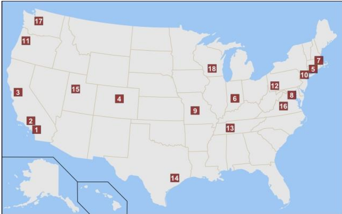
Table 14: In FY 2009, NLM Sponsored Trainees at 18 Institutions